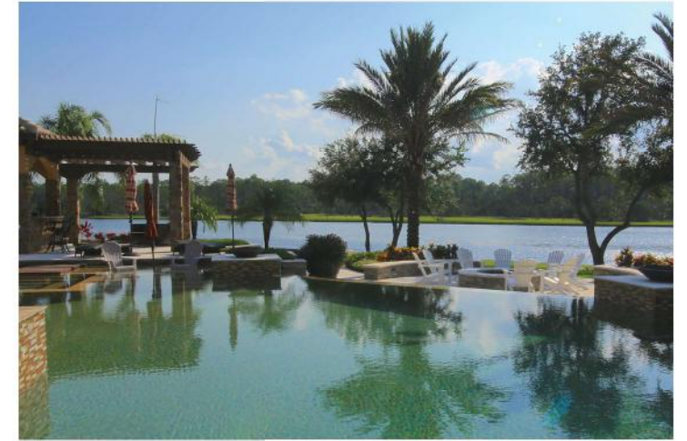
CrystalStones Natural Sandy Beach