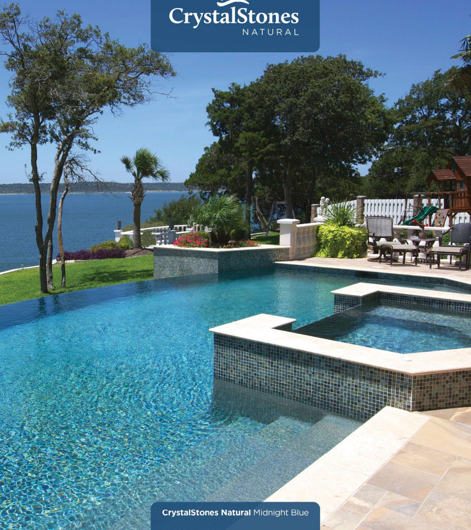
CrystalStones Natural Midnight Blue